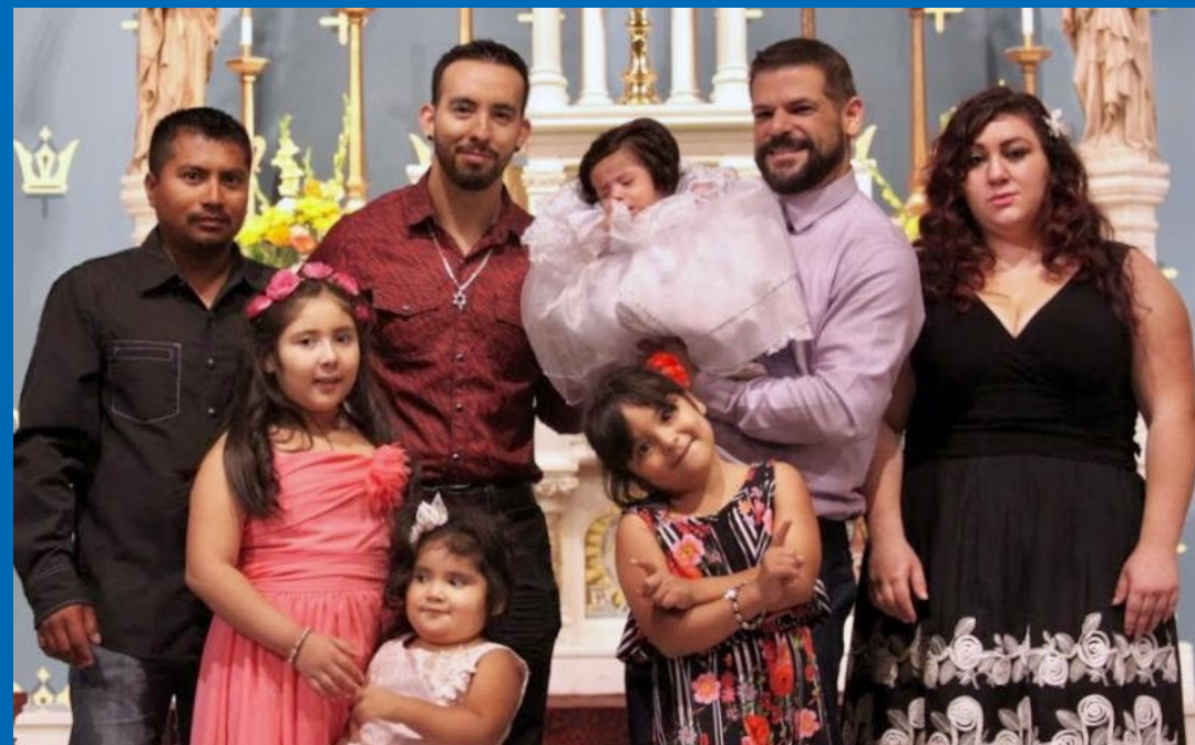
Ascension Connections at Grant Park