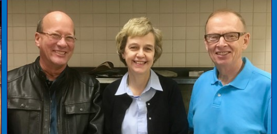
Community Thanksgiving Meal — Please help!