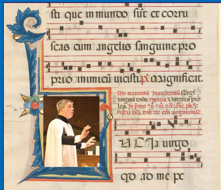
Five centuries of sacred music