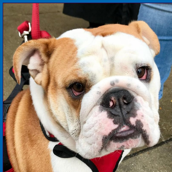
Thanks for the pet blessing!