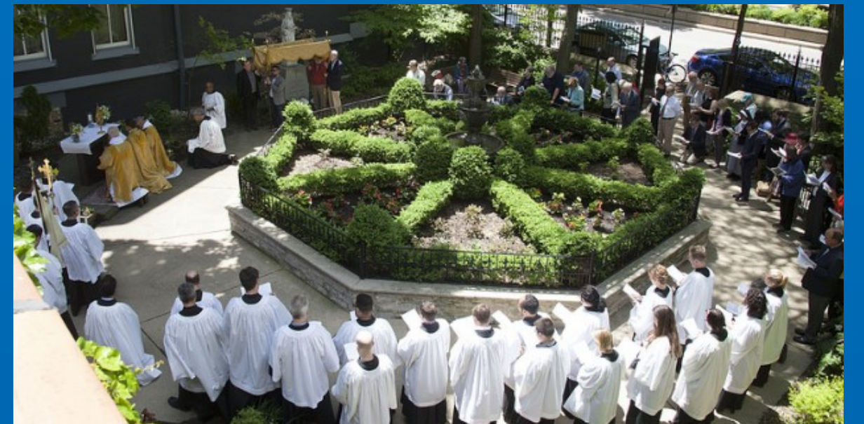
Corpus Christi 2018