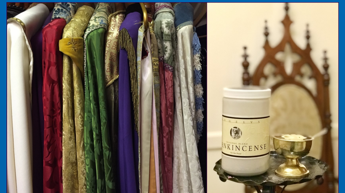
We can cope ... with the smoke