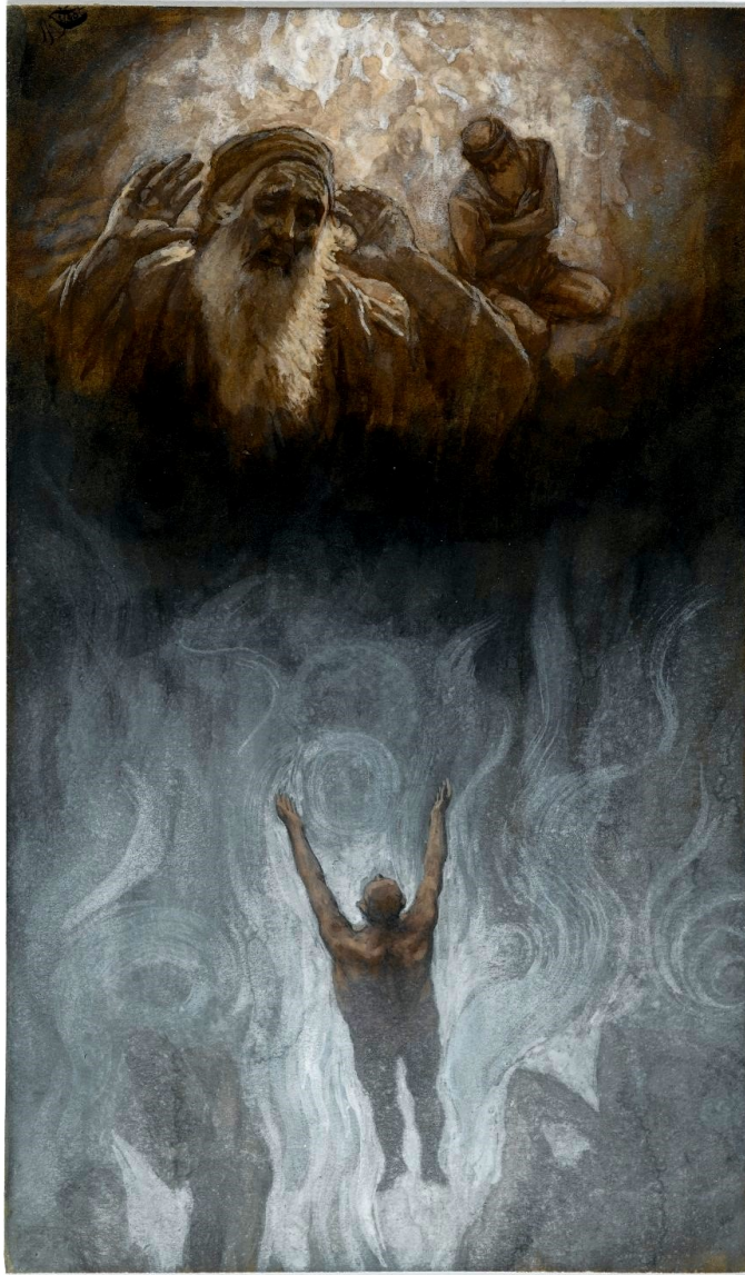
James Tissot (1836-1902). The Bad Rich Man in Hell ( Le mauvais riche dans l'Enfer ), 1886-1894. Opaque watercolor over graphite on gray wove paper, Brooklyn Museum