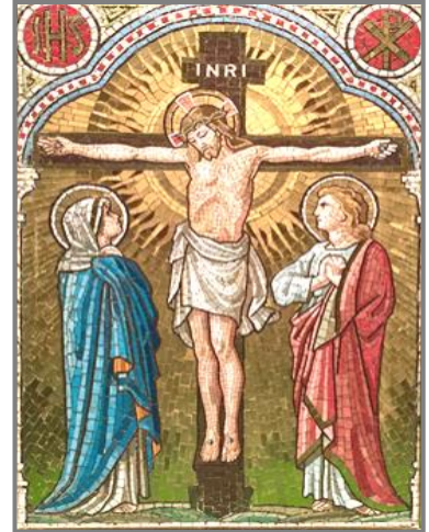
The mosaic on the door of the Altar tabernacle, Church of the Ascension

THE CHURCH OF THE ASCENSION is a parish in the Episcopal Church, a province of the Anglican Communion within the Catholic Church. Our Christian life and worship is rooted in the Anglo-Catholic tradition. As an Anglo-Catholic parish we praise, worship, and adore our Lord Jesus Christ in the Blessed Sacrament, rejoice in the Communion of Saints, and relish in the beauty of liturgy and music. Thank you and bless you for being with us this day.