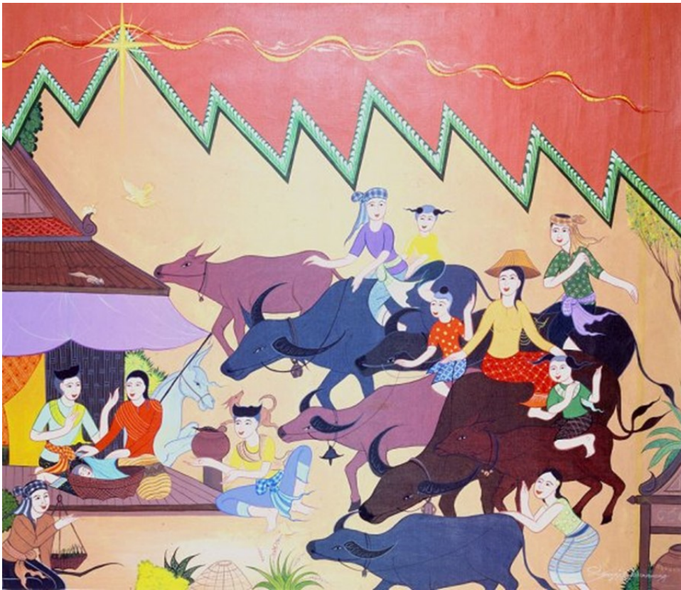
Nativity, Sawai Chinnawong, 2004