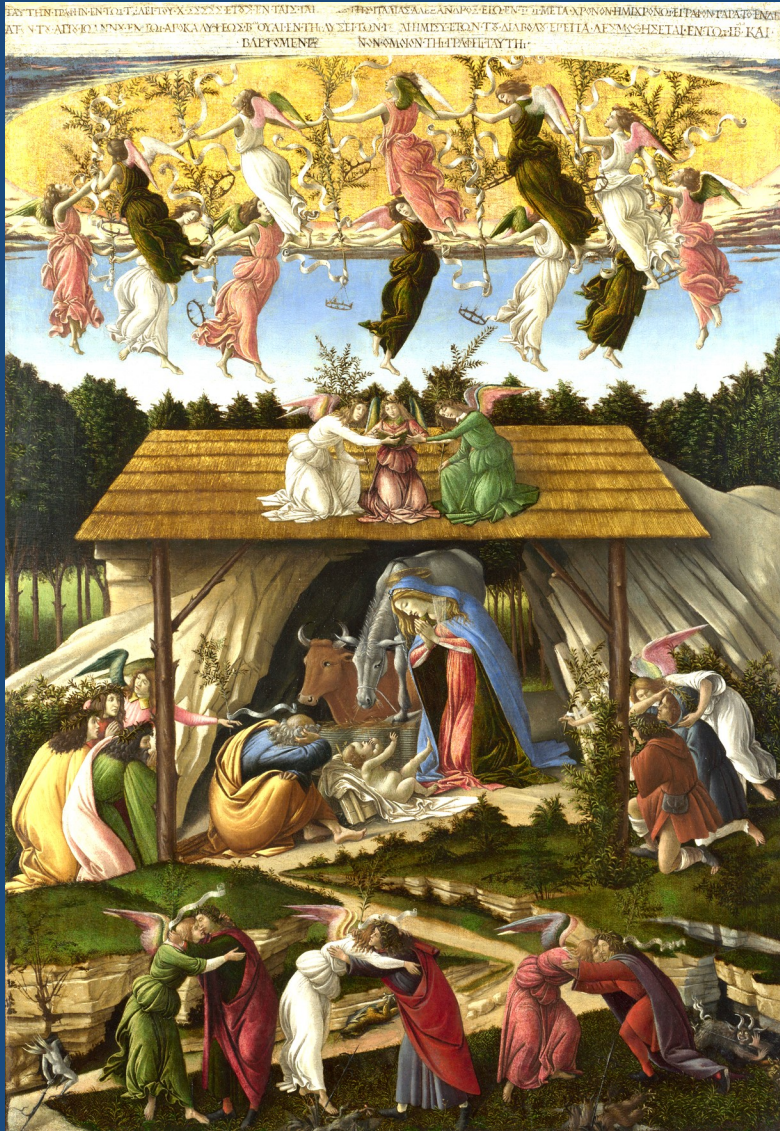
Mystical Nativity, (ca. 1500-1501) Sandro Botticelli, National Gallery, London