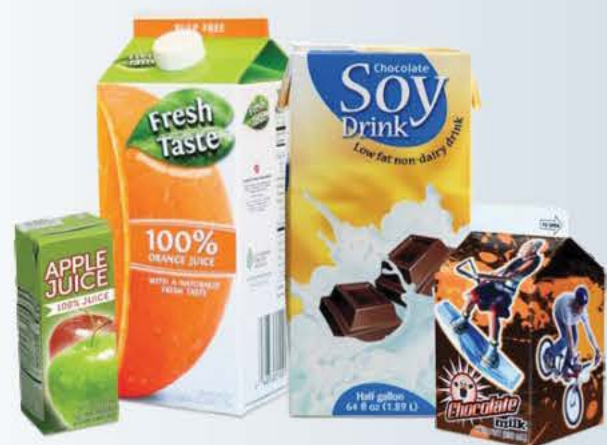
Food and Beverage Cartons

For RRRASOC Member Communities: Farmington, Farmington Hills, Milford, Milford Township, Novi, South Lyon, Southfield, Walled Lake, Wixom