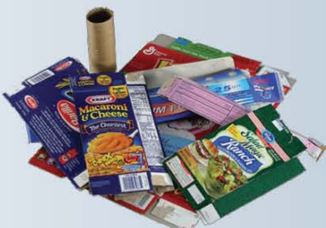
Paperboard boxes (cereal, pasta, & tissue)