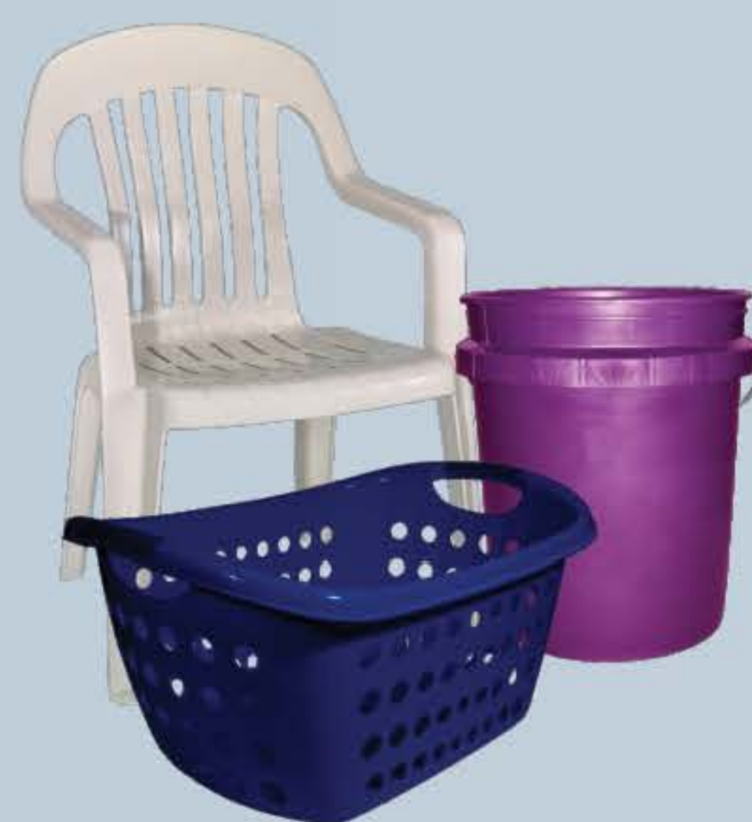
Bulky Rigid Plastic (buckets, chairs, toys)