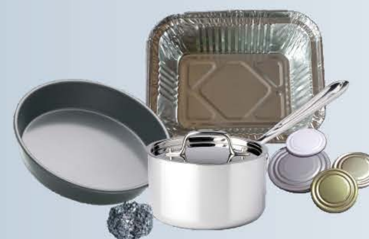
Household scrap metal