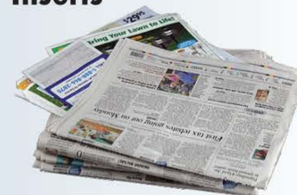
Newspapers, Magazines, Brochures & Inserts