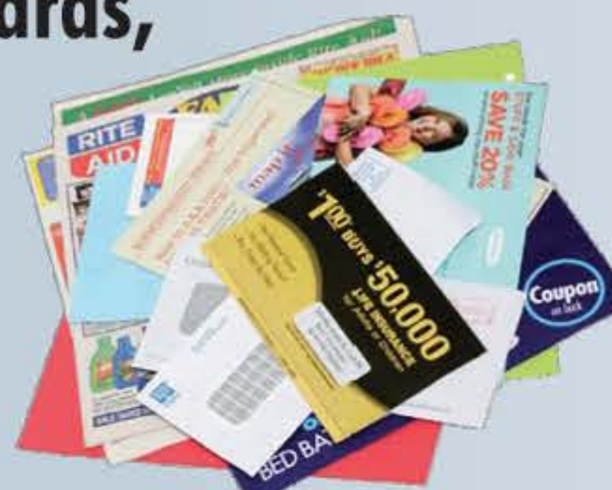
Greeting cards, regular & junk mail