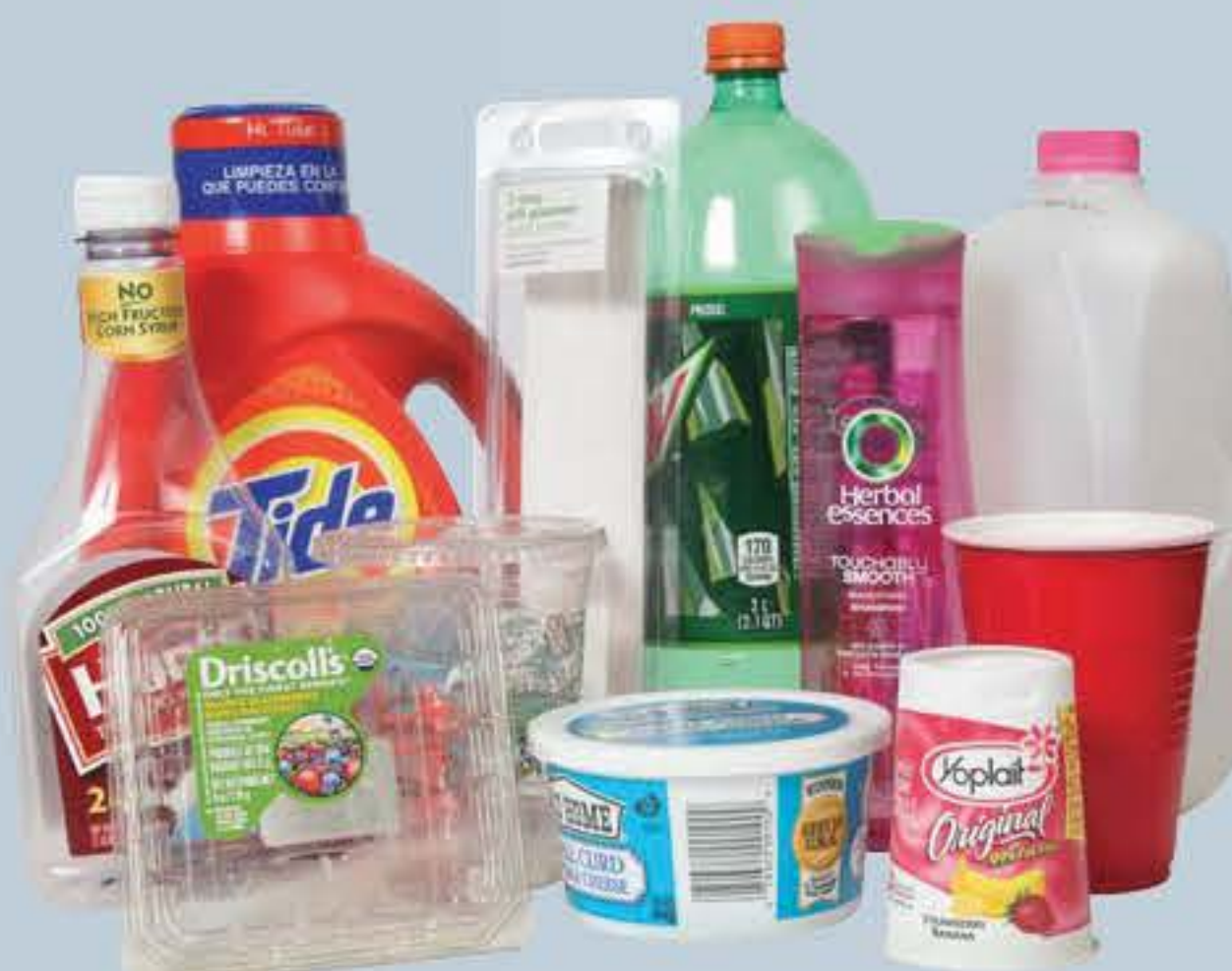
#1, #2 and #4-#7 Plastic containers (NO Foam/Styrofoam)