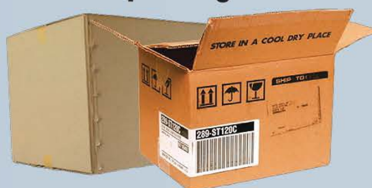
Corrugated cardboard & Paper bags