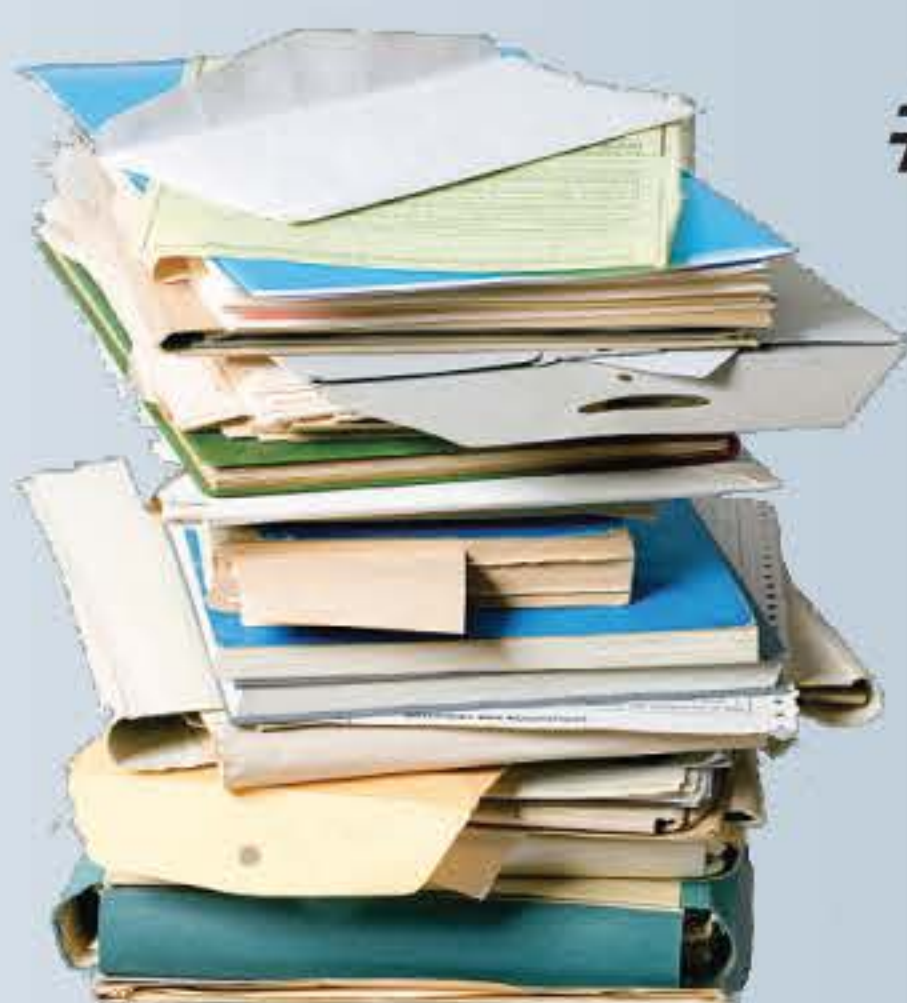
File folders, office paper & gift wrapping paper