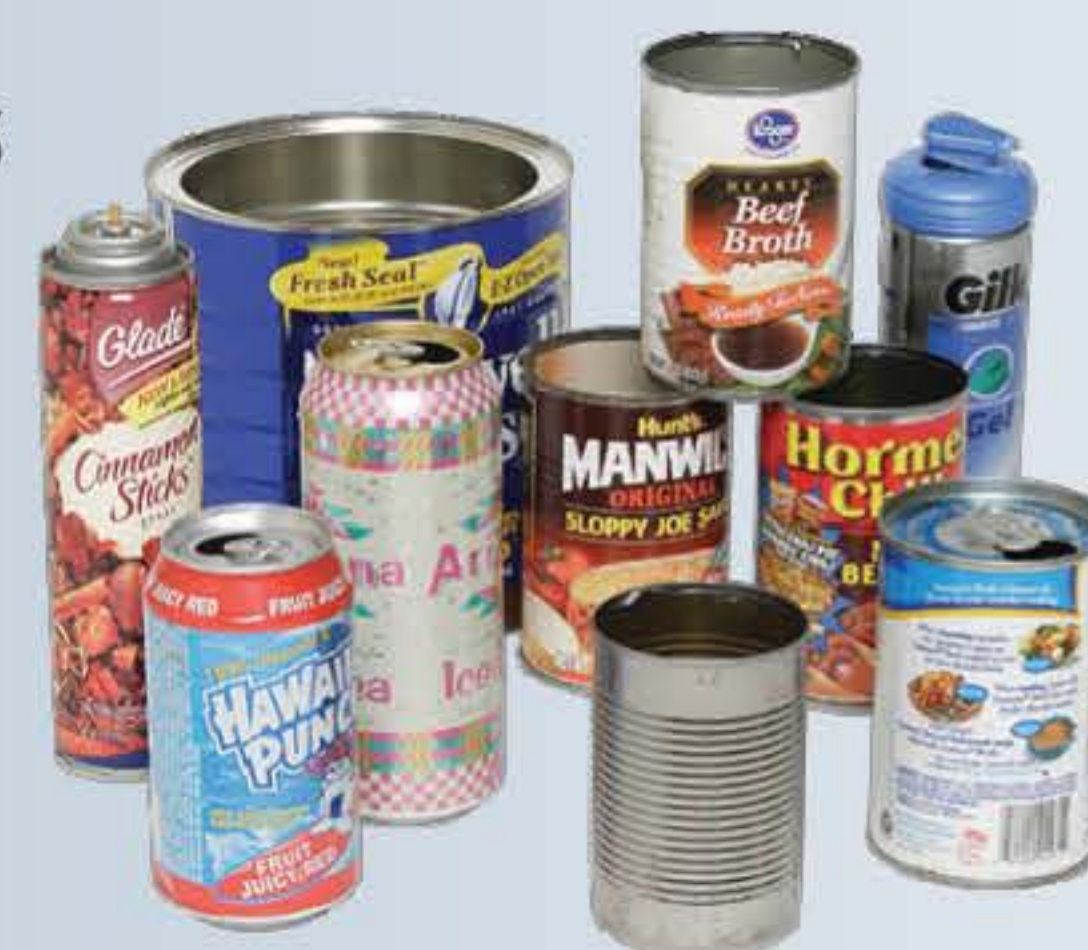
Aluminum & Metal Cans