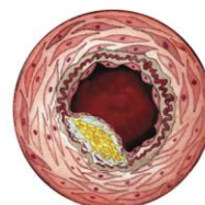
As you age, arteries can become partially blocked or even collapse