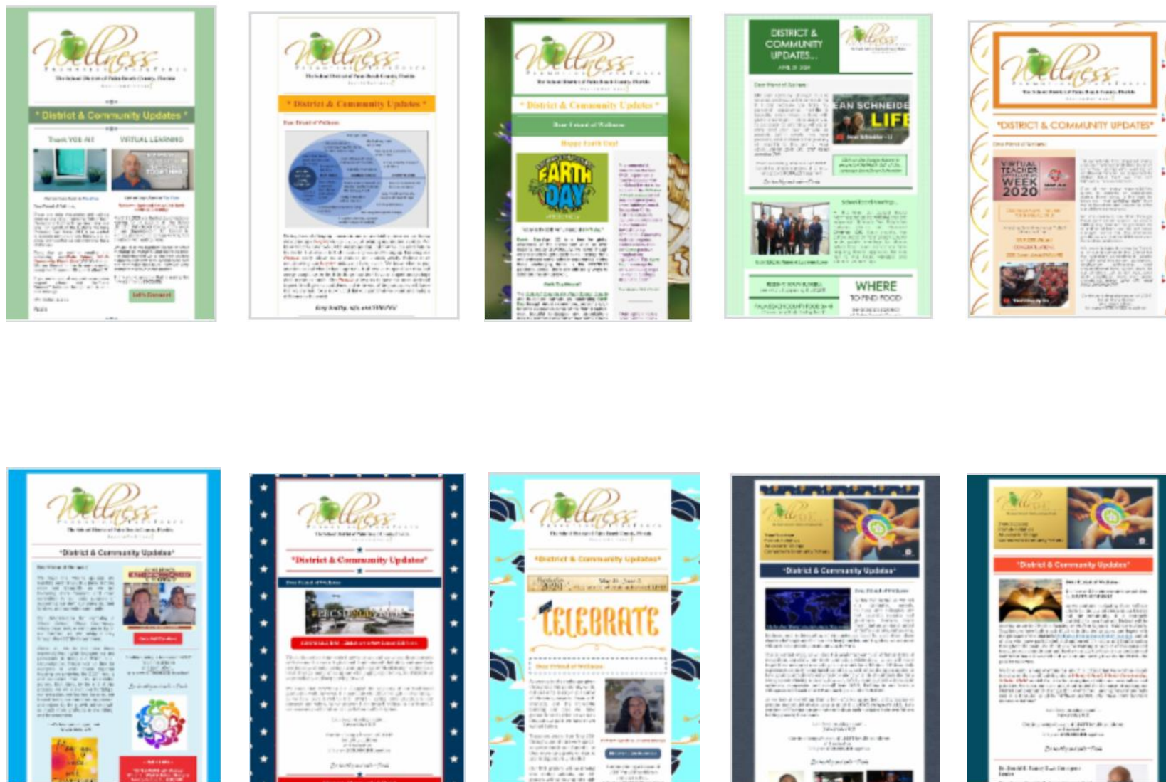
'Wellness Promotion: District and Community Updates' Newsletters...being 'Wellness Activists' at a critical time of COVID-19