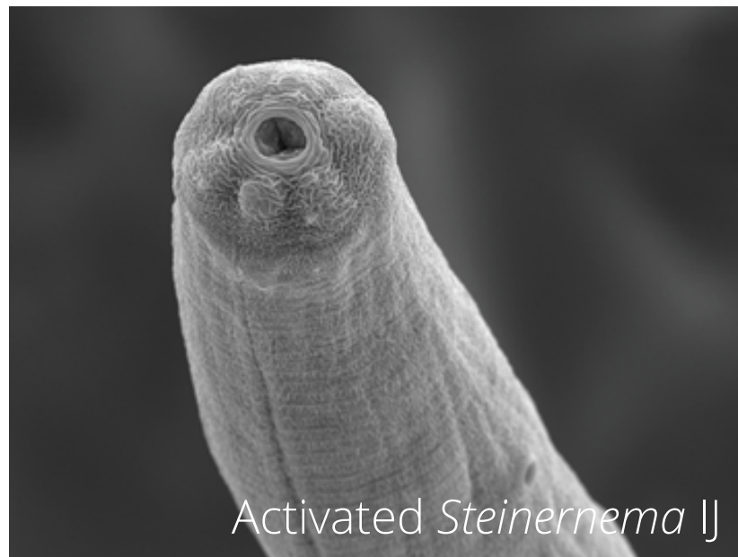
Activated Steinernema IJ

"Natural products from Photorhabdus and Xenorhabdus and their role in nematode symbiosis and insect killing"