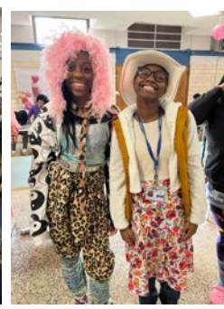
Wacky Tacky Day