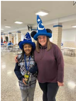
Disney VS Nickelodeon