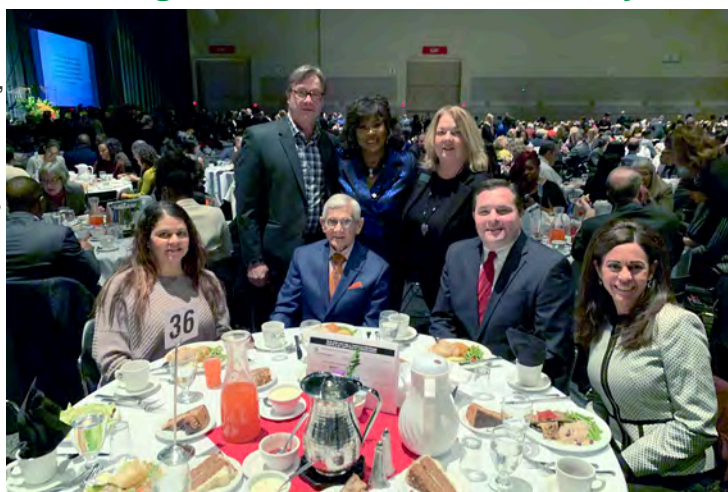
Pictured: The Delta Township Board celebrating the extraordinary life of Dr. Martin Luther King Jr. at the Annual MLK Luncheon held at the Lansing Center on January 20.

In June, the Delta Township Board passed a resolution to further its efforts to affect change in the Township.