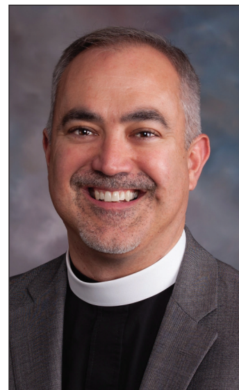
The Very Rev. Craig Loya

Consecration of the new bishop is scheduled for June 6, 2020.