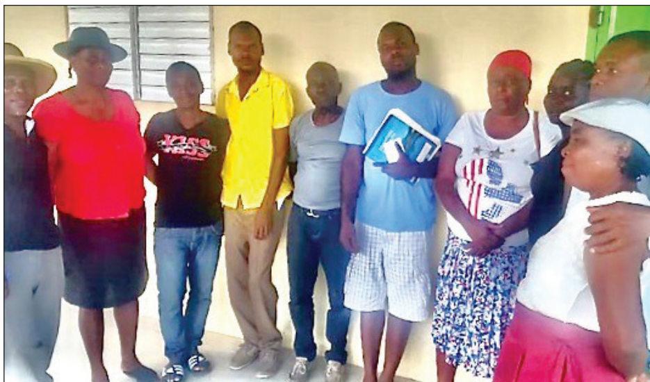
Leaders of Bonne Nouvelle gather for January phone conversation with St. James.