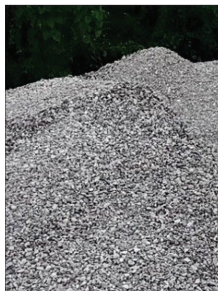
Gravel for Bonne Nouvelle's walls.