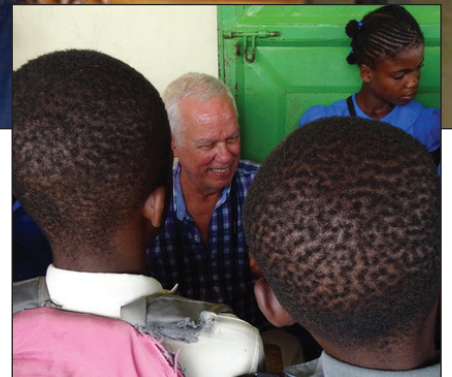
Page 5: Bonne Nouvelle rebuilds their church, destroyed by the earthquake in 2010.