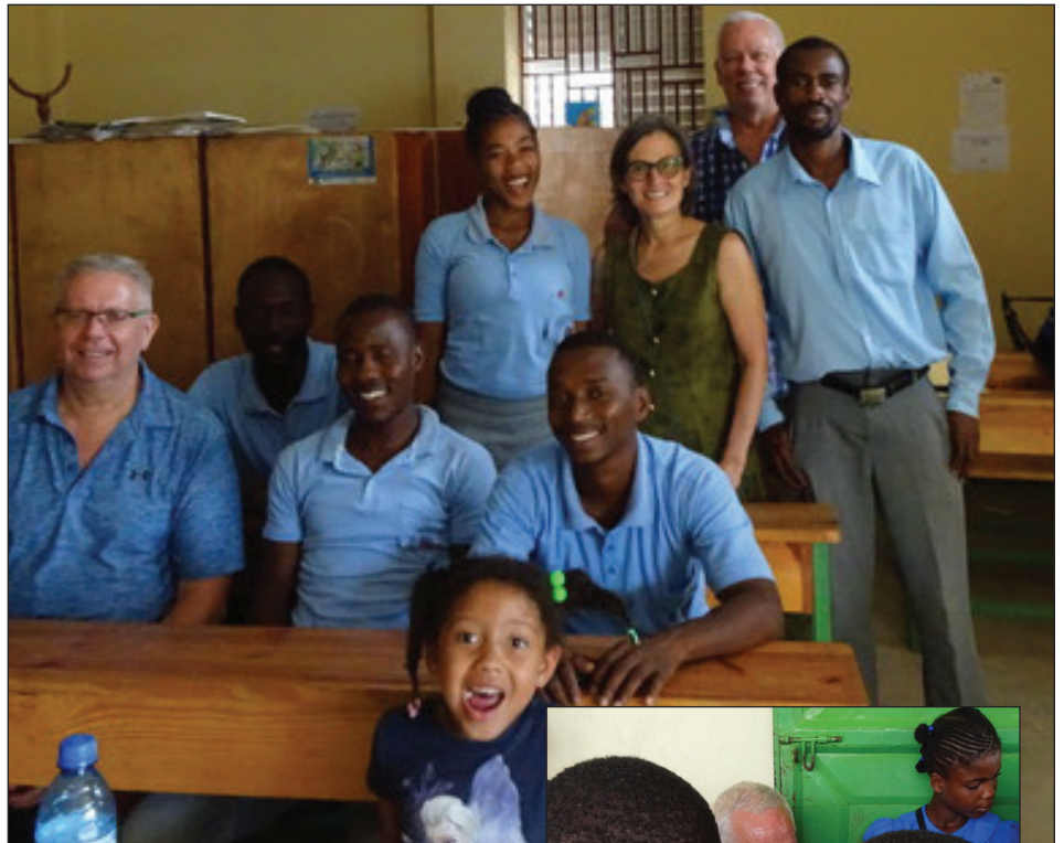
This page: 2018 visit to Bonne Nouvelle