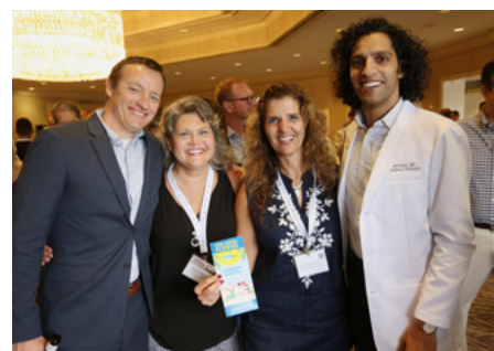
Exhibit Hall Opens