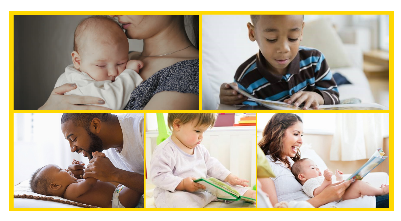
Plan | Collect | Donate