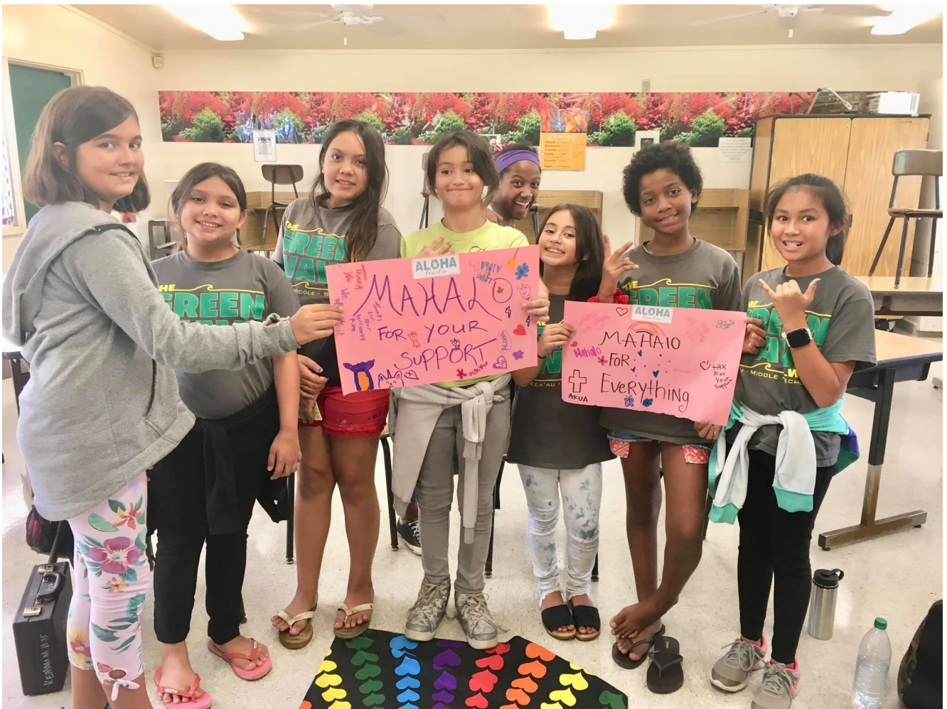
Girls Circle at the All Stars After School Program at Kea'au Intermediate School

We are deeply thankful for the support our friends have shown us on Giving Tuesday, we raised $1,640.