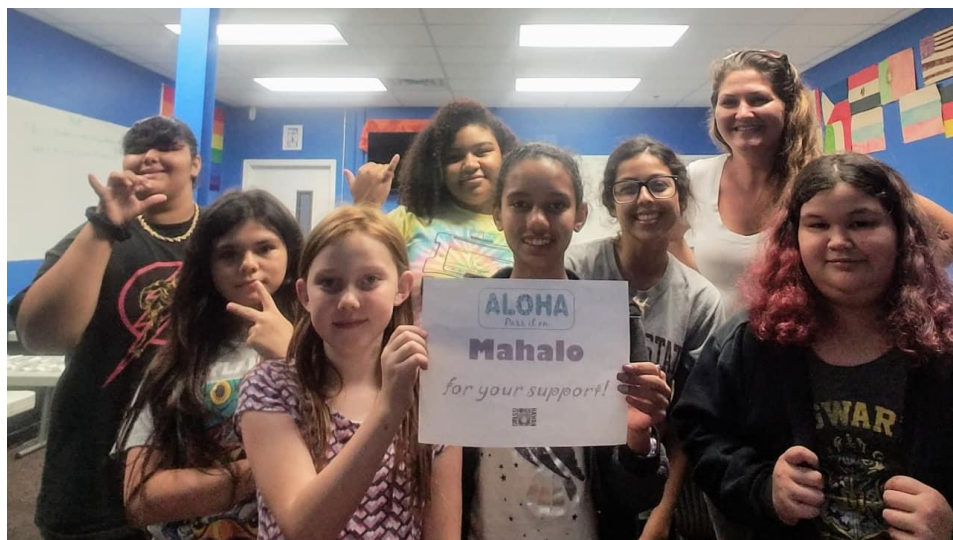
Girls from Studio Shaka After School Program at Connections Charter School

Huggo's, Huggo's on the Rocks, and Lava Lava Beach Club restaurants supported us through gathering donations and donating a portion of proceeds from food and retail sales to our organization, as well as promoted us at the front desk which extended our networking with people from all over the world.