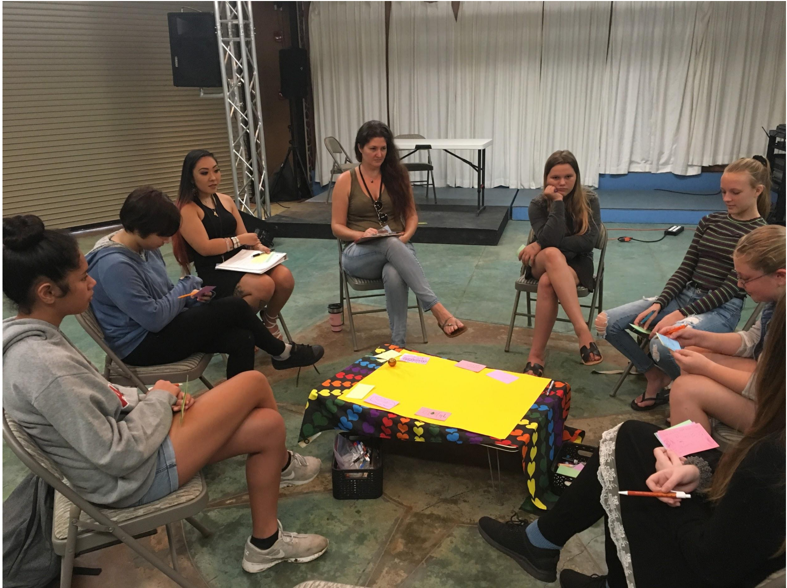
Circle in action! At the Hawai'i Academy of Arts and Sciences