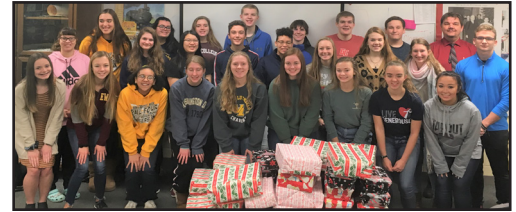
VL's Key Club students pose with wrapped gifts for an area homeless shelter.

- Valley's Key Club participated in a local project that provides toiletries, gloves, hats, and other basics to local men and women in need. Key Club sponsored 76 boxes that were donated to a local homeless shelter. Key Club members collected monetary