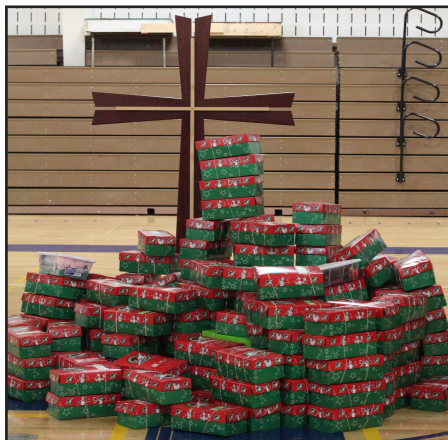
215 shoeboxes were gathered together under the cross at a chapel service in late November.

Valley Lutheran is proud to be a high school where students can explore and develop their passion(s). From National Honor Society to Environment Club, French Club to Protect Life Club, students have a wide-variety of extra-curricular opportunities that help shape them into well-rounded high school graduates!