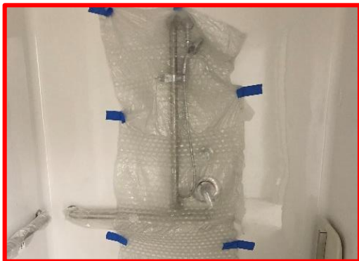
Picture 5: Showerhead and Grab Bars in the Exercise Science Shower Room