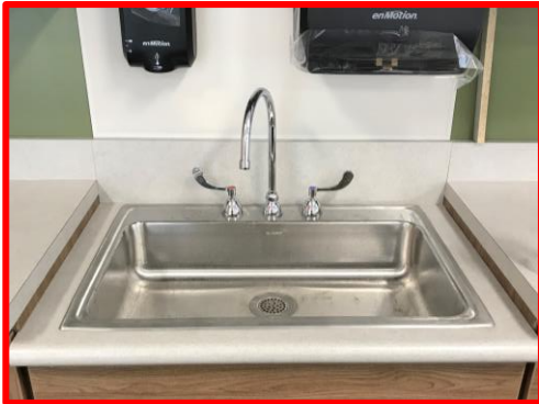
Picture 1: Finished Sink and Accessories in the Early Childhood Development Room