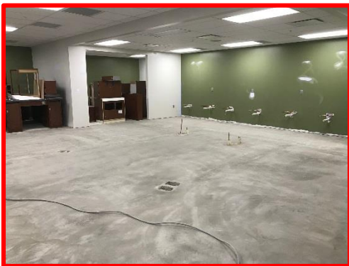
Picture 4: Preparation for Luxury Vinyl Tile Installation in Cosmetology