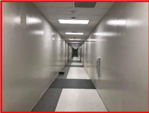
Picture 1: Corridor between the Biology/Chemistry Labs and Exercise Science