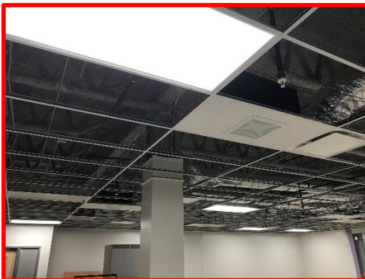
Picture 2: Speakers and Fire Protection Drops to Acoustical Ceiling Grid in the Exercise Science Lab