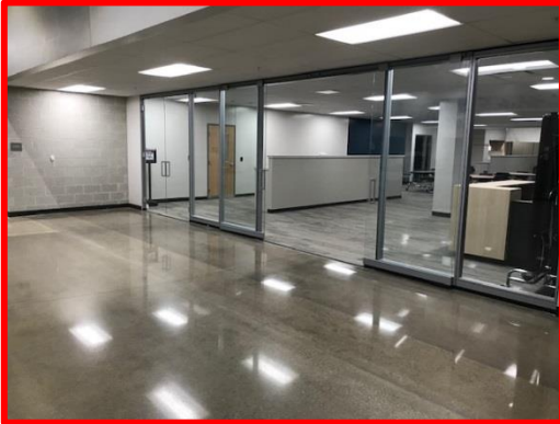
Picture 1: Polished Concrete in the Connector Entrance to the Media Center