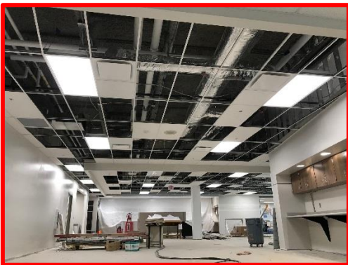
Picture 6: Fire Alarm, Fire Protection, and Technology In-Ceiling Devices in the Academic Learning Commons