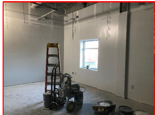
Picture 7: Prime and First Coat of Paint in Mary Beth's Future Office