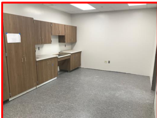
Picture 3: VCT and Casework in the Early Childhood Development Workroom