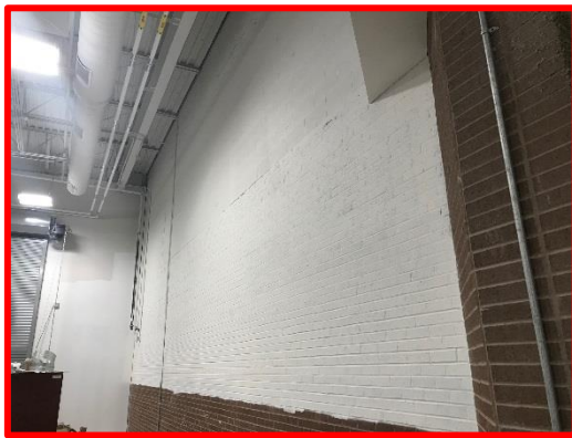
Picture 4: Prime and First Coat of Paint in the Fire Service Tech Garage