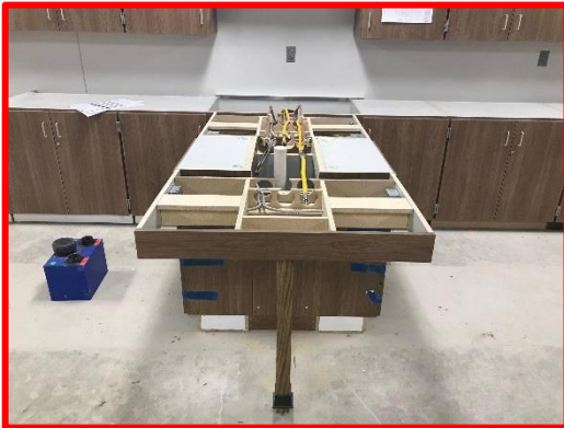
Picture 1: Plumbing and Electrical Connections to Casework in the Biology Lab