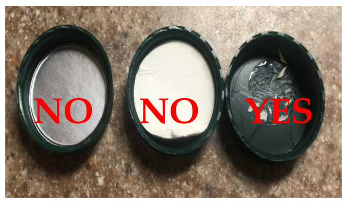
NO Foil inside cap! The foil can be removed for the cap! Thin layers of paper will not hurt our process.

The only stupid question is the question that is never asked.