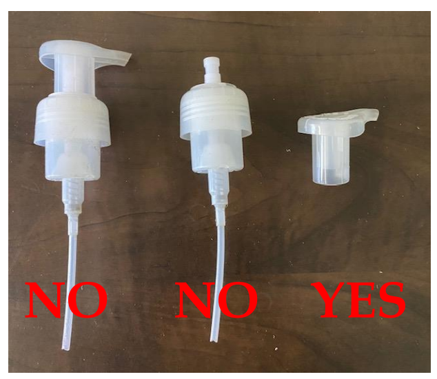
NO Mechanical Pumps with metal spring inside! The Cap can be removed for the base!