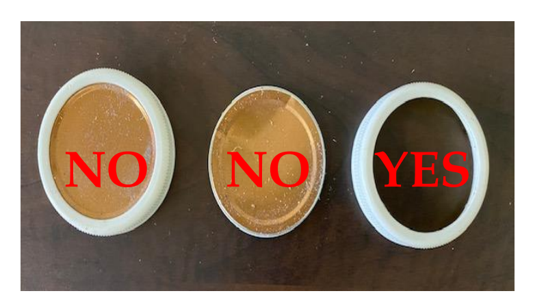
NO Plastic Ring with Metal Inside! Sneaky guy! The plastic ring can be removed from the lid! Bonus points for recycling the metal piece with your local recycler.