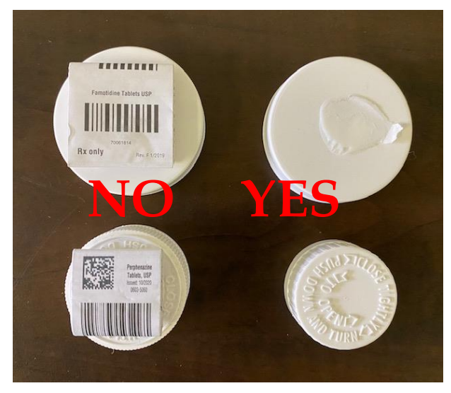
NO large amounts of paper! The paper can be removed for the cap! Small amounts of glue will not hurt our process. Like above and below photos.