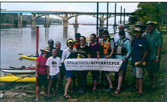
RiverTrek 2017 Team