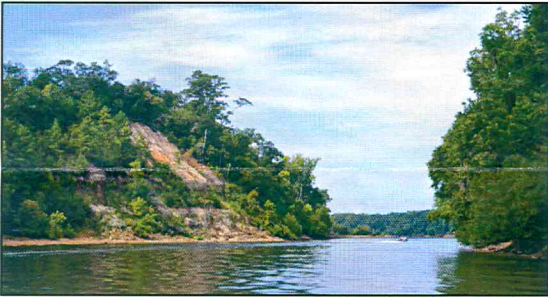
Apalachicola River, Alum Bluff