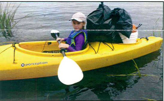
Franklin County Coastal Clean Up