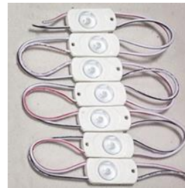
Qwik Mod 1

Our standard LEDs are the Principal LED Qwik Mod™ Series. Available in 1, 2, 3 or 4 module styles. We do have other brands and series available for special circumstances and customer requests. The Qwik Mod™ Series LEDs have a Diamondback 170° Optic Lens, Integrated aluminum heatsink, Durable IP68, Snap & Peel Qwik Release Tab and 4 different mod styles to perform in a wide variety of sign applications as well as efficient light diffusion with a wider batwing resulting in better coverage. Also comes with a reliable 5&5 Warranty. Also available is the Qwik Mod colors that come in Red, Green and Blue. For reverse channel signs, the LEDs are attached to the backs facing inward to create the perfect halo effect. If the LED color options available do not suit your reverse channel sign project, we can also place vinyl on the polycarbonate back to offer a wider variety of color options. Our standard LEDs come with a 5-year product warranty and a 2-year labor warranty.