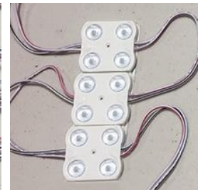
Qwik Mod 4