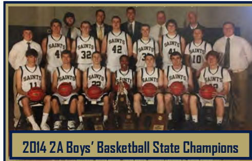
2014 2A Boys' Basketball State Champions