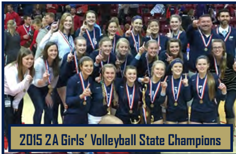
2015 2A Girls' Volleyball State Champions

FOR GENERATIONS SAINTS HAVE HOISTED TROPHIES WHILE LEARNING TO EXCEL IN ALL FACETS OF THEIR LIVES, THANKS TO SO MANY WHO GENEROUSLY SUPPORT SAINTS ATHLETICS. SAINTS FAN CLUB PROVIDES BOTH VOLUNTEER SUPPORT AND FUNDING FOR ALL OUR ATHLETIC PROGRAMS AND EVENTS INCLUDING EQUIPMENT, UNIFORMS, OFFICIALS, FACILITIES, AND MORE. THANK YOU FOR YOUR TREMENDOUS LOYALTY OF OUR VIBRANT SAINTS COMMUNITY AND FOR HELPING PROVIDE IN ALL AREAS OF SUPPORT NECESSARY FOR OUR STUDENT-ATHLETES TO BE SUCCESSFUL.