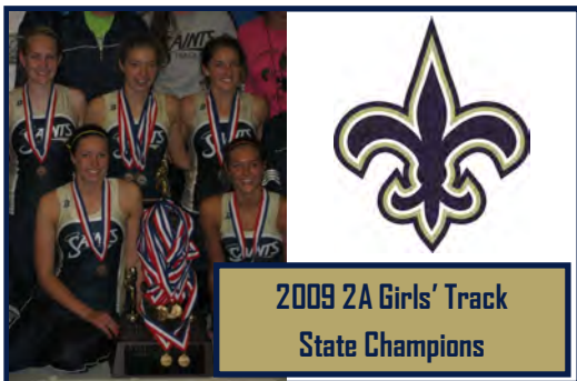
2009 2A Girls' Track State Champions