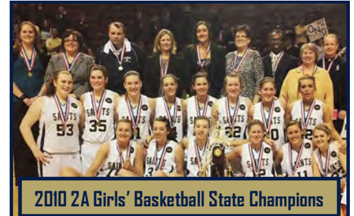
2010 2A Girls' Basketball State Champions