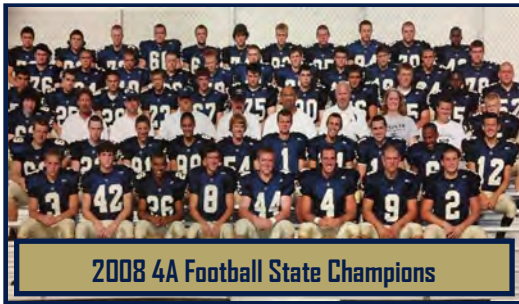
2008 4A Football State Champions