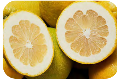
Oro Blanco Grapefruit