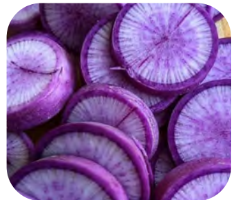
Purple Ninja Radishes