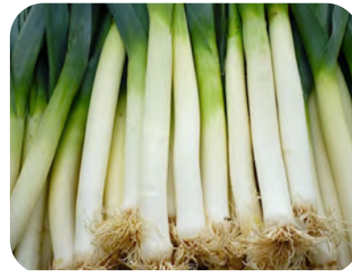
Baby French Market Leeks