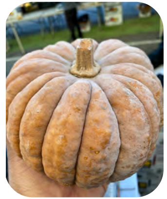
Black Futsu Squash