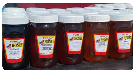
Energy Bee Farm Honey