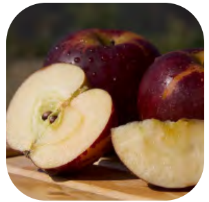
Black Arkansas Apples