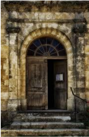
Door opens in