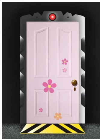
Door to face fears