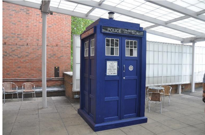
Door leads out of comfort zone