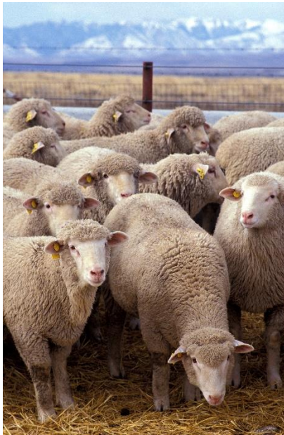
Part of a whole