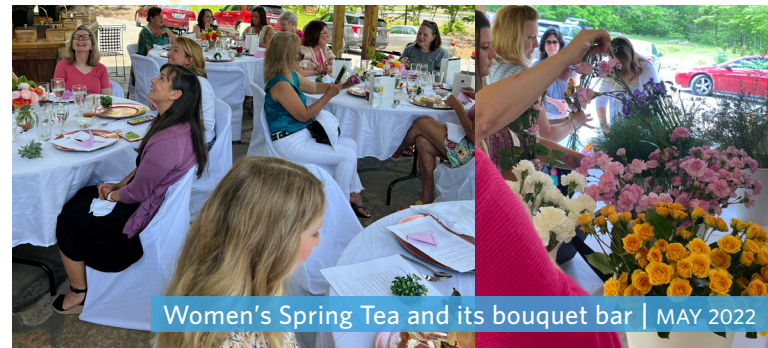
Women's Spring Tea and its bouquet bar | MAY 2022

2023 Save the Date: Women's Spring Tea is Saturday, May 20.