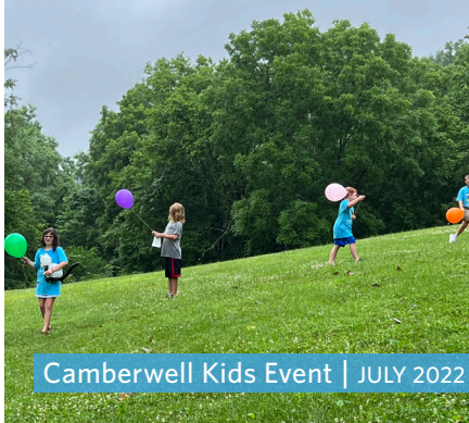
Camberwell Kids Event | JULY 2022