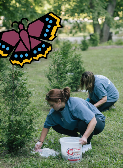
Volunteer Clean Up Day | JULY 2022