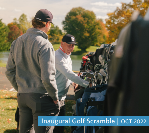
Inaugural Golf Scramble | OCT 2022