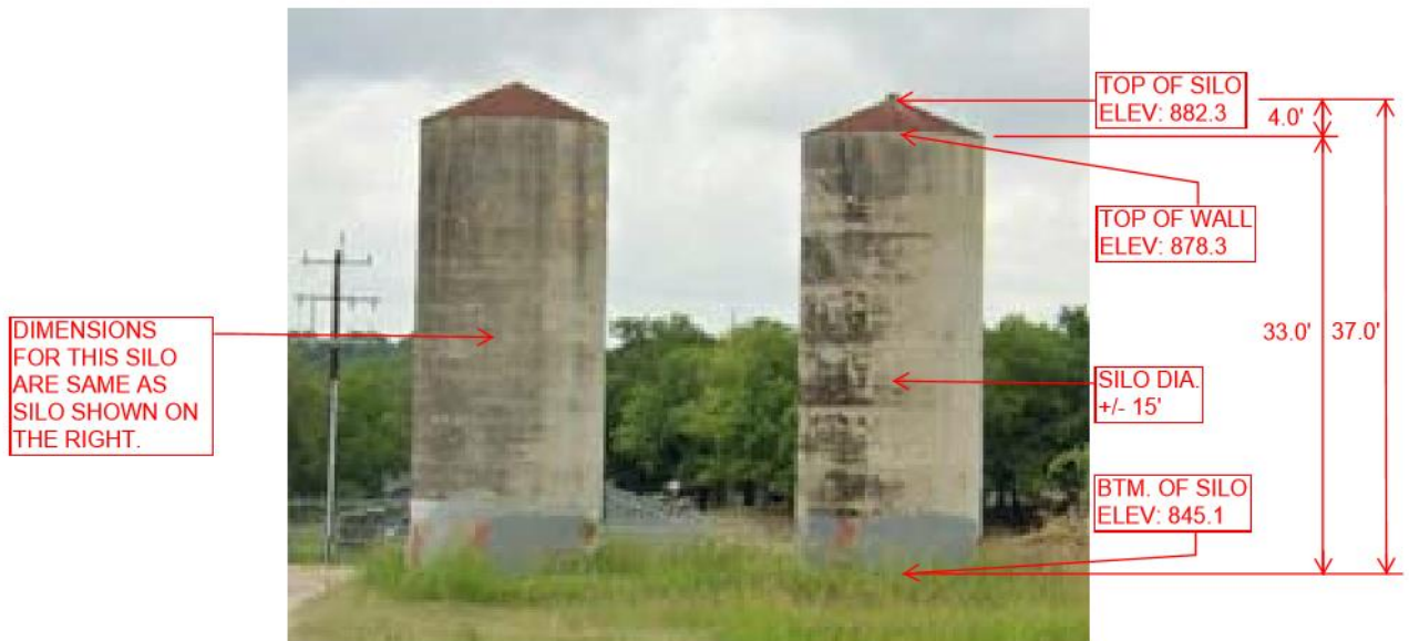
7520 HUEBNER ROAD SILOS