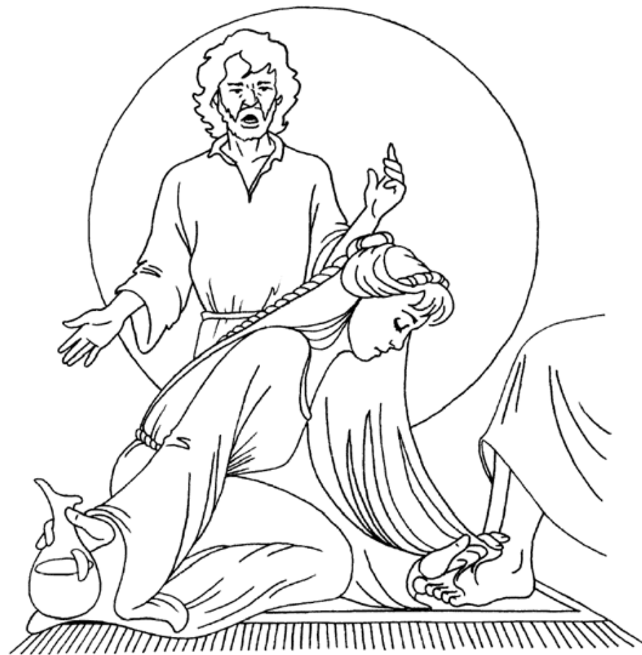
Mary Anoints Jesus' Feet John 12: 1-8

Copyright © CalvaryCurriculum.com Used by Permission