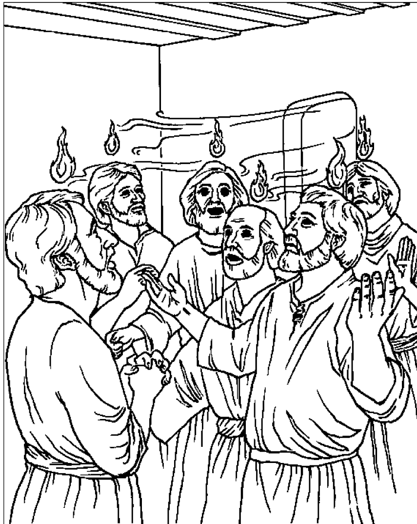
The Day of Pentecost Acts 2

Each number represents a letter of the alphabet. Substitute the correct letter for the numbers to reveal the coded words.