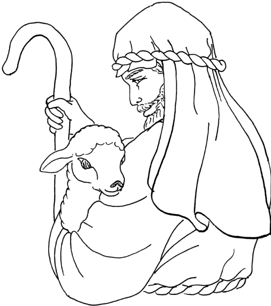
The Good Shepherd

Copyright © CalvaryCurriculum.com Used by Permission