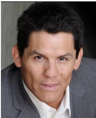
The Legend Frank Shamrock