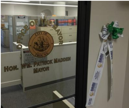
Clockwise from upper left: Ulster County Building, City of Yonkers, City of Auburn City Hall, Office of Troy Mayor William Madden, Town of Oyster Bay, Albany County DA David Soares