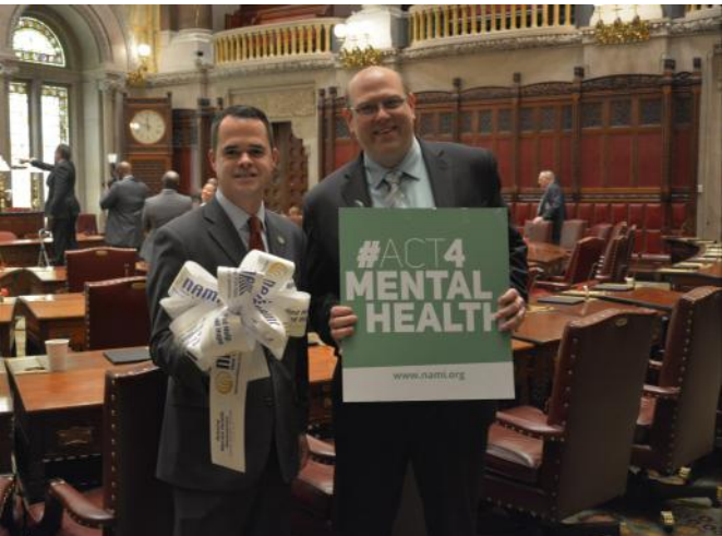
NYS Senator David Carlucci Brings Ribbons in to the Senate Chamber