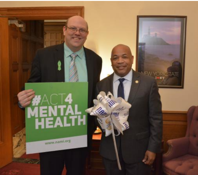
NYS Assembly Speaker Carl Heastie