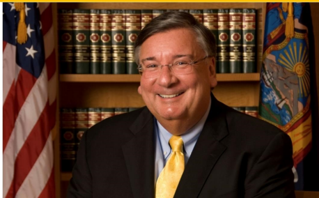
THE HONORABLE MATTHEW J. D'EMIC ADMINISTRATIVE JUDGE 2ND JUDICIAL DISTRICT