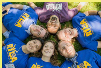
Rotary New Generations.

Thank you to those who are helping to spread the stories of District 5100 on Instagram. Remember to post your photos to Instagram or Facebook with the hashtag #rotaryd5100. The theme for October is Rotary at Work so post those pictures of your club projects involving youth.