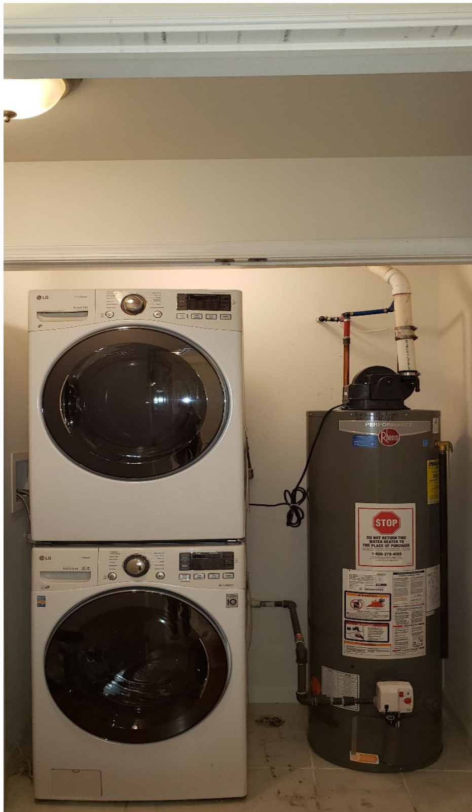
Washer-Dryer / Water Heater Area Per Condo