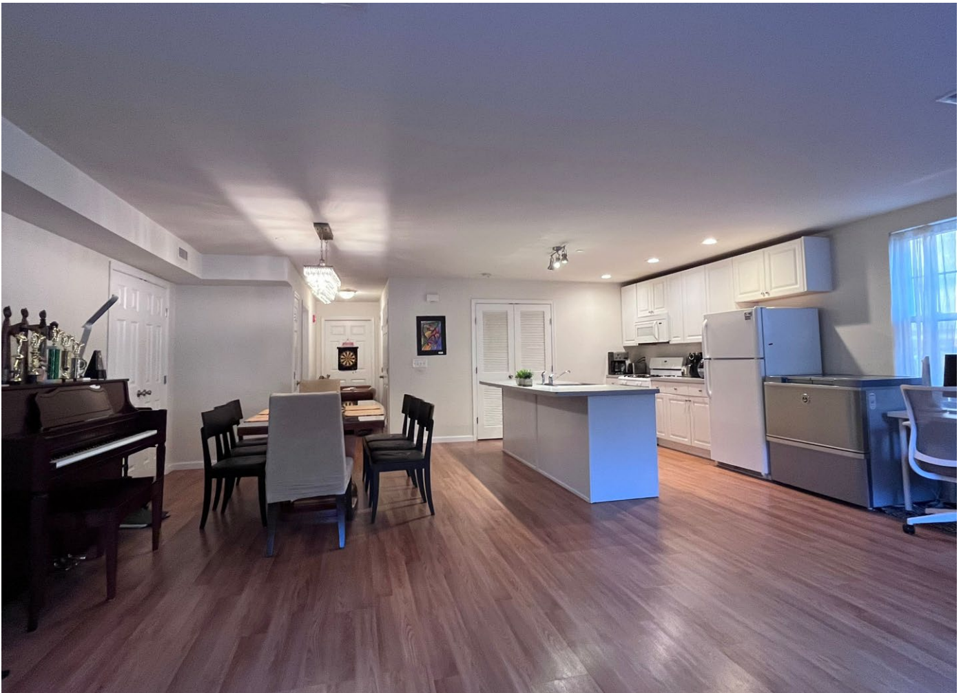
Full Area View 1 st floor.

Westchester Bee Line offers services on Route 5 & 6 between the Bronx and Westchester, Route 1C to Westchester Community College in Valhalla. Metro North Hudson line is available in Hartsdale, Scarsdale, Ardsley and Dobbs Ferry with access to New York City. Accessible to the Saw Mill River Parkway, Sprain Brook Parkway and I-87 (New York State Thruway).