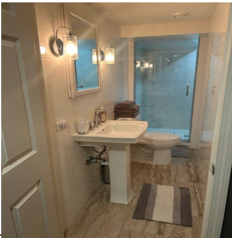
Basement Bath w/ walk -in glass shower