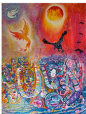
PANDEMIC death & recovery