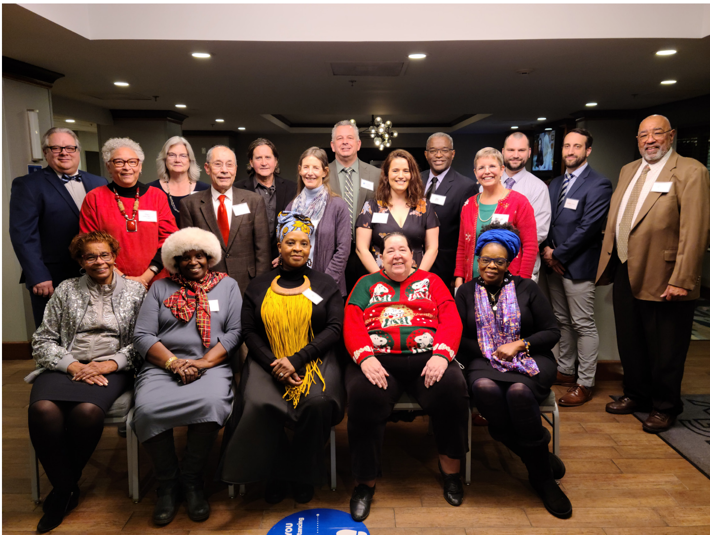
Congratulations to the recipients of the 2022 CCAA Community Arts Development Grant! Grants were awarded at the CCAA Grantee Reception on December 8 at the Hampton Inn in Waldorf, MD.