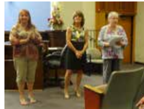
Spring Dell representatives accept on behalf of their artists.