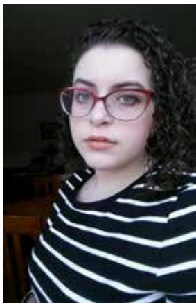
Illustration with a minor in painting and animation. He wants to attend a college dedicated to art in order to "...be challenged and grow as an artist."