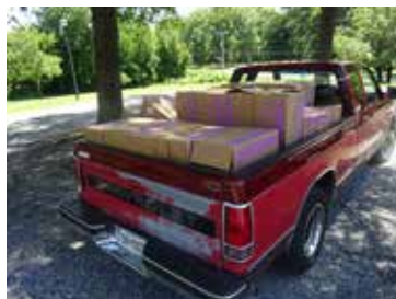
Loaded and ready for delivery!