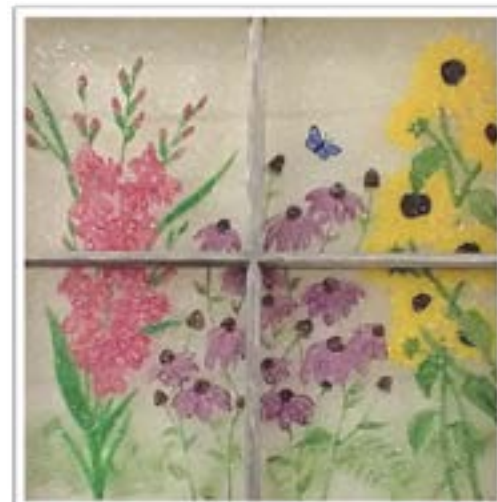
A Sunny Day