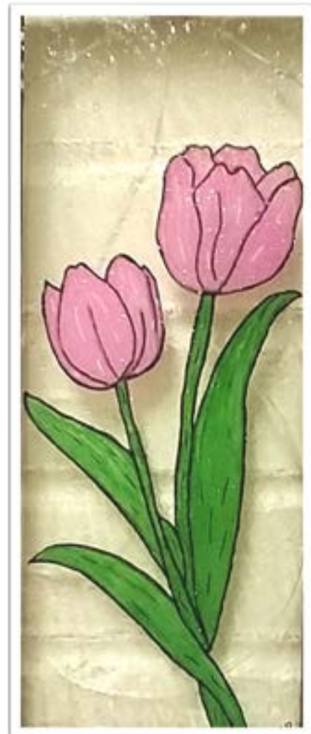
By: Joyce Reid #8 Tulips Acrylics on glass 7" x 14"