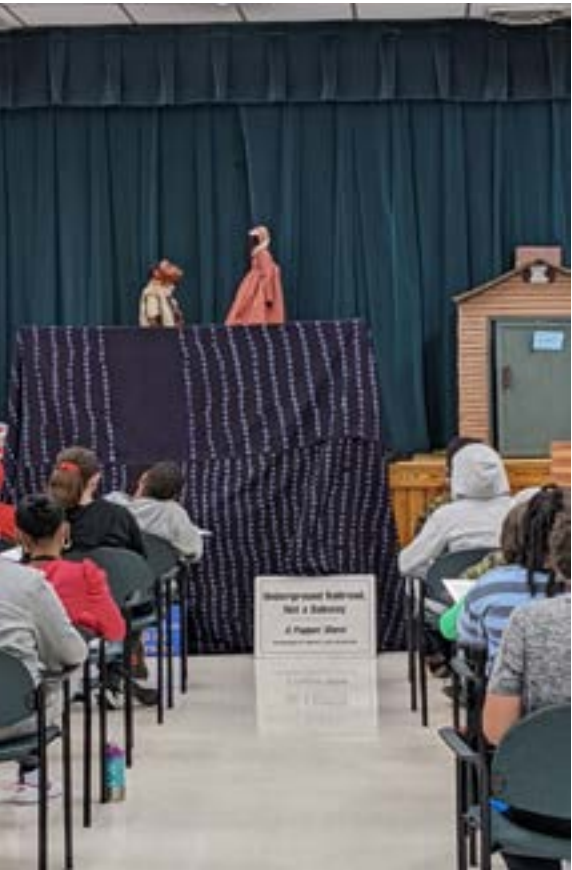
As part of our three-year plan and as a cultural kick-off we presented at Nanjemoy Community center on April 27th, 2022

A wonderful puppet performance. We had a total of 46 students, 3 chaperones and 10 seniors in attendance, in cooperation with Charles County Public Schools.