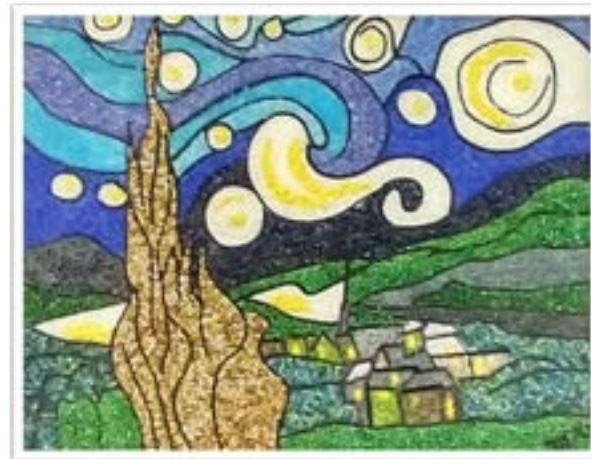
My Starry Night