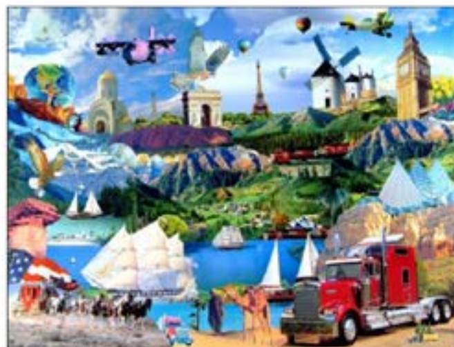
FLORENCE FOSTER "GO" 2003