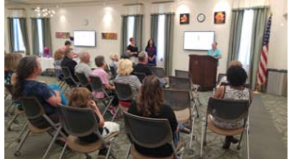
Exhibit Runs through July