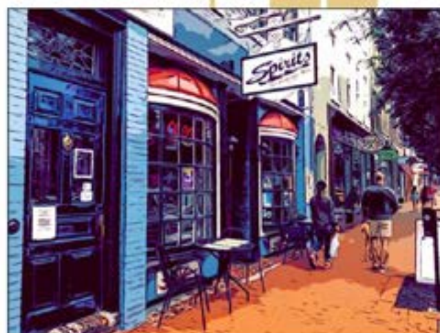
KATHLEEN NOEL "DOWNTOWN FREDERICKSBURG" PHOTOGRAPHY/2020