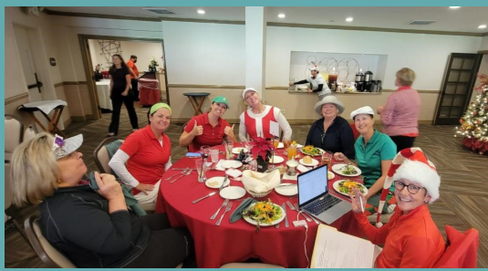
2021 Chapter Holiday Event at Singing Hills

It's important to create a positive and supportive environment for all members when we gather and enjoy each other's company on the fairways as well as the 19 th hole. I encourage you to take a moment to read the LPGA Amateurs Code of Conduct policy that we are all obliged to follow as part of our membership. Especially during these crazy times in which we live, I think this is a great time to remind ourselves to be kind, patient, and understanding, even when things get as tough as the rough at Torrey. Wishing you happy golfing!