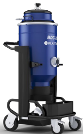
BDC-23 DUST COLLECTOR

Blastrac Dust Collectors reduce airborne dust and particulate to provide a cleaner work environment, make surface preparation atmospheres more pleasant, and improve safety.