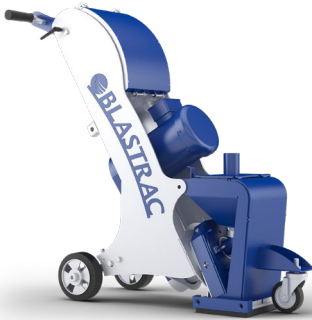
1-8DM SHOT BLASTER