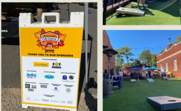
CORNHOLE TOURNAMENT OCT 22, 2022