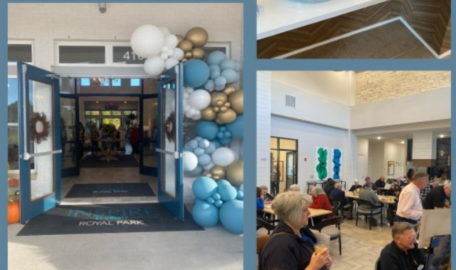
BUSINESS AFTER HOURS INSPIRE ROYAL PARK OCT 20, 2022