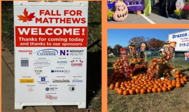
FALL FOR MATTHEWS OCT 15, 2022