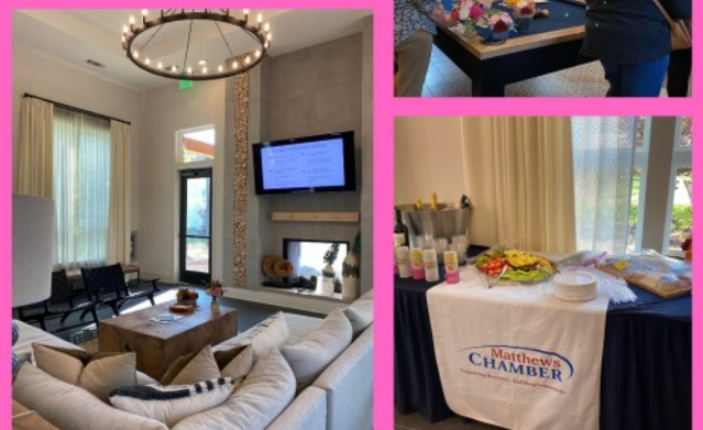
WOMEN IN BUSINESS OCT 26, 2022