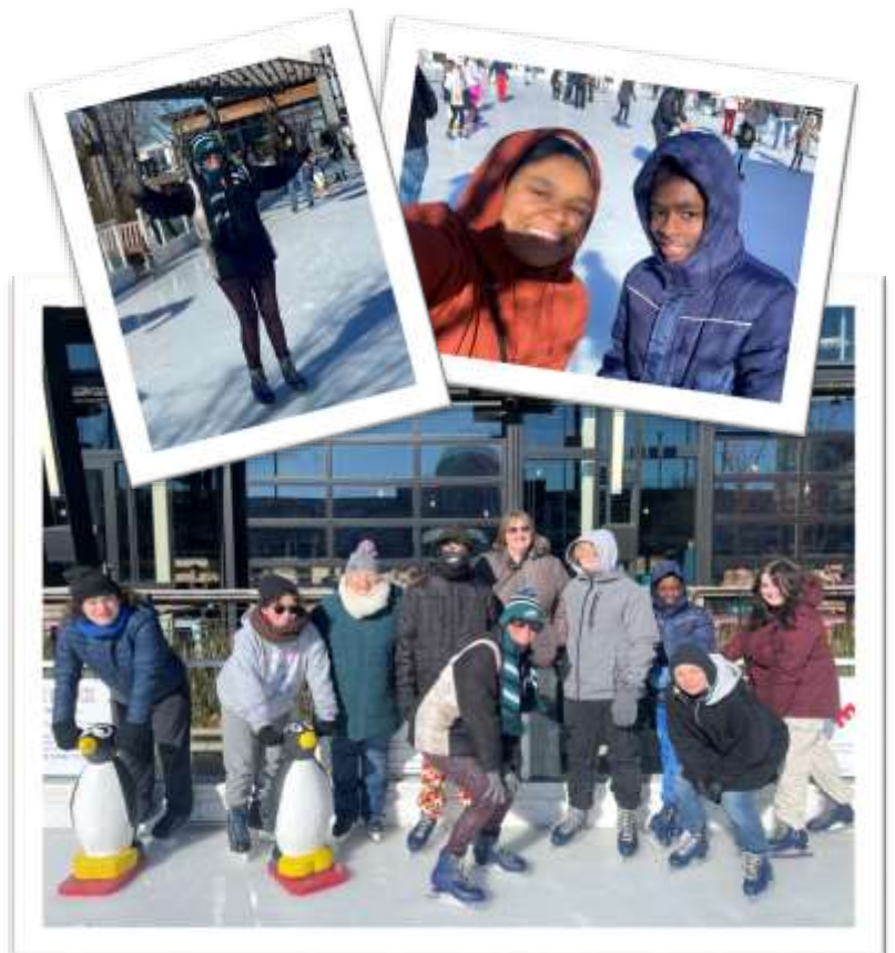
Ice Skating at The Avenue 2023