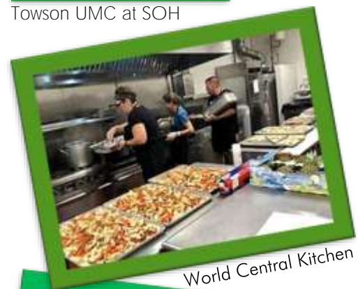
World Central Kitchen