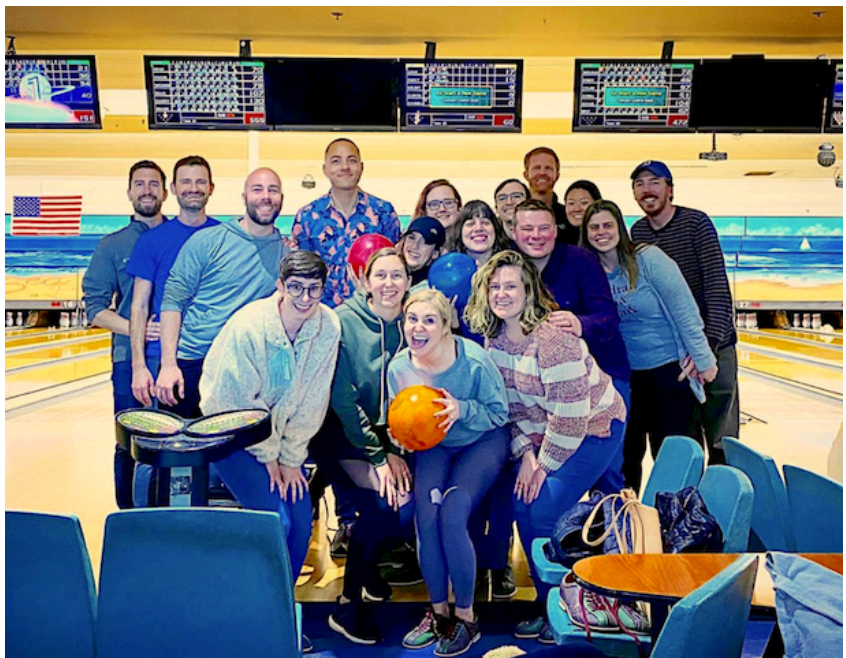
Happy League Players